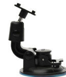
Mounting Base with suction cup